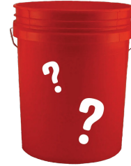
Unknowns (5+ Gal.)

Sharps can consist of needles, syringes, scissors, or any device with sharp points that can puncture skin.